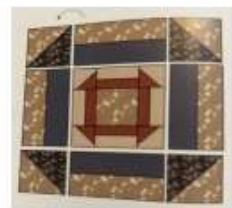
Center + outer makes block