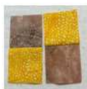
Forming 4 Patch