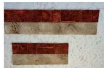
Bkgd and Main sewn together