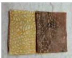
Cut into segments