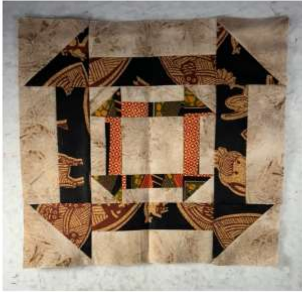
12 ½ Inch Unfinished