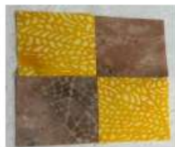
Makes a 4 patch