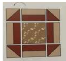
6 1/2" Center